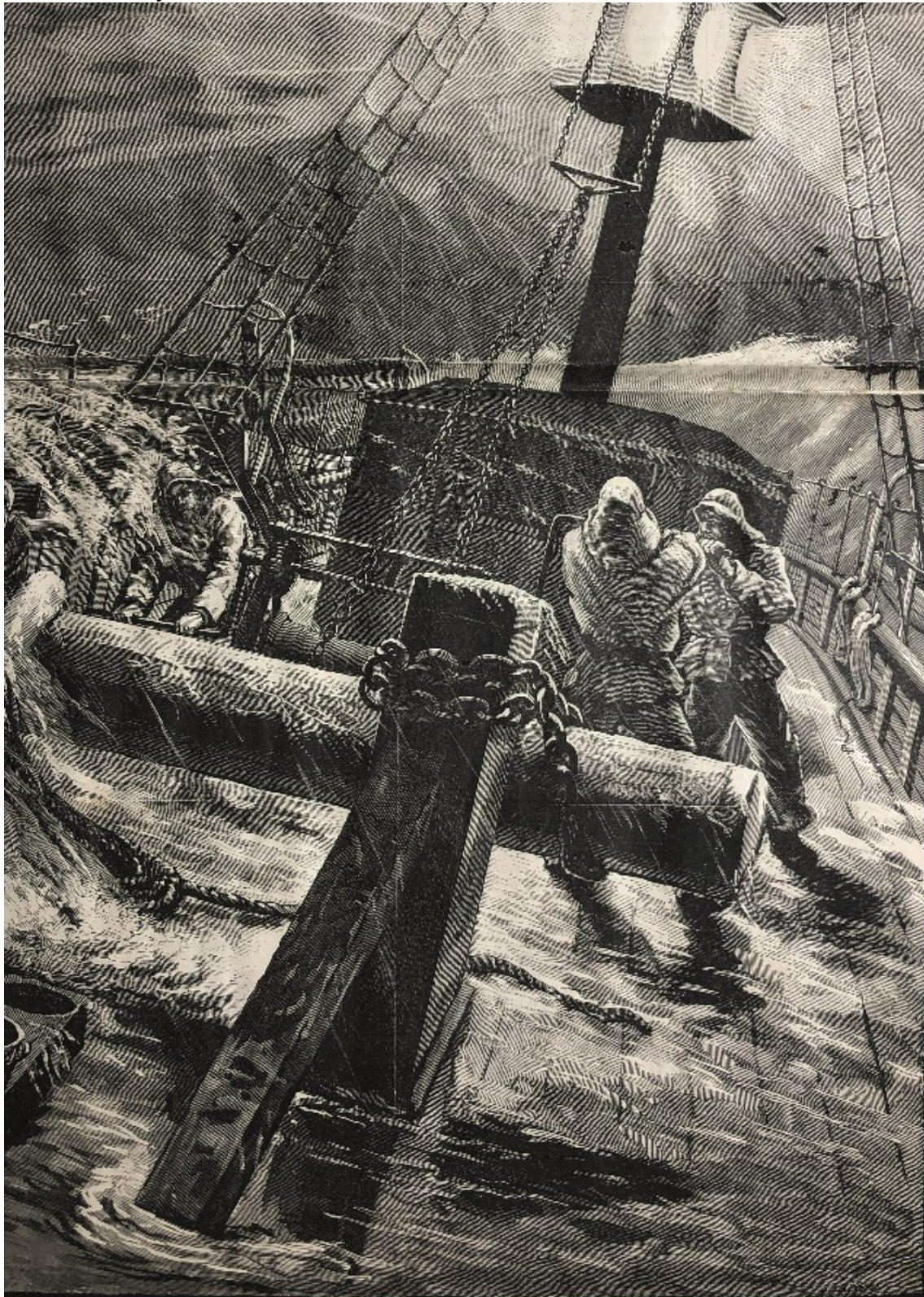
POINT GELLIBRAND LIGHTSHIP.

Great Expectations of Sunday's 26 th Nov. sea conditions off Port Melbourne for Race four.