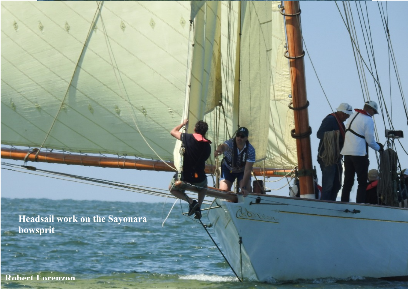
Headsail work on the Sayonara bowsprit