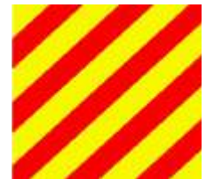
Code Y PFD's on thank you

For the record when code Y is flying all crew competing in the designated race are required to don PFD's. Make sure this happens. It's a mandatory DSQ for non compliance.