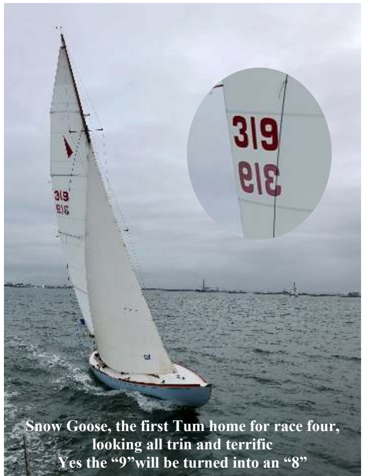
Snow Goose, the first Tum home for race four, looking all trim and terrific Yes the "9" will be turned into an "8"

While it was sure cold out on the water it was a heart warming post race soiree experience on the RMYS Marina